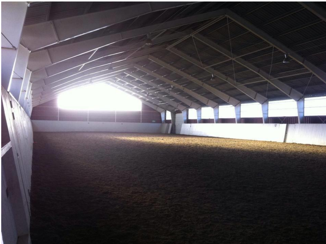
Our riding hall