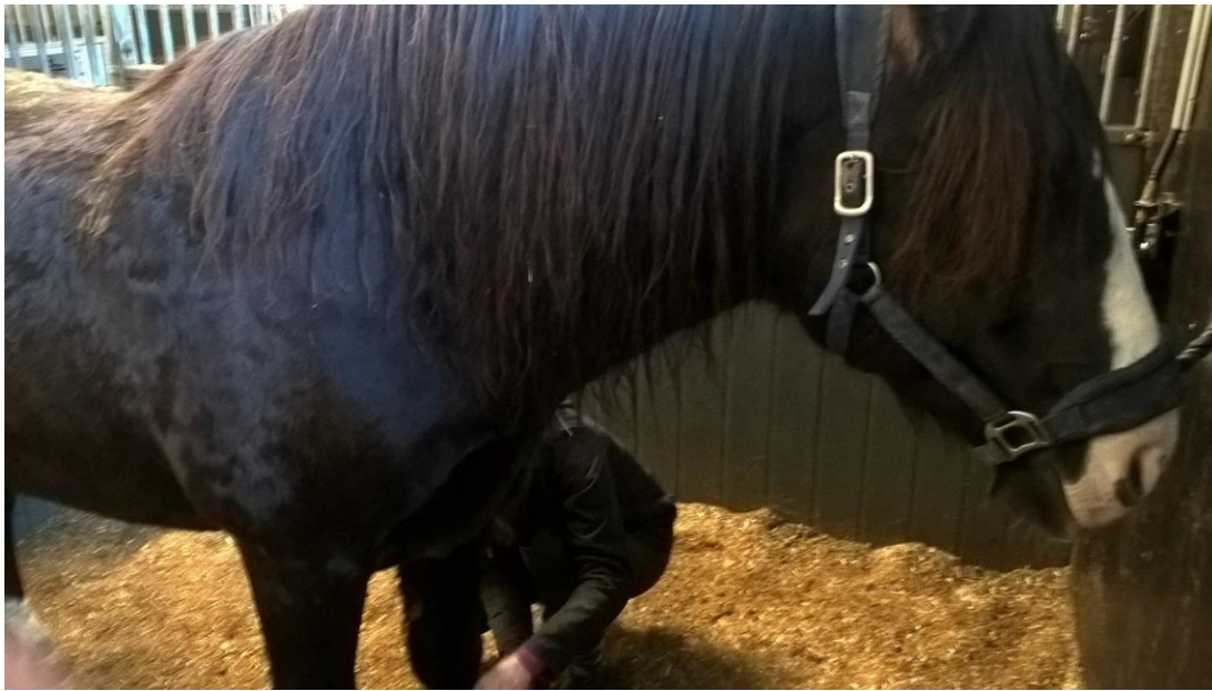
A student applying bandages to the horse legs preparing her for a ride.